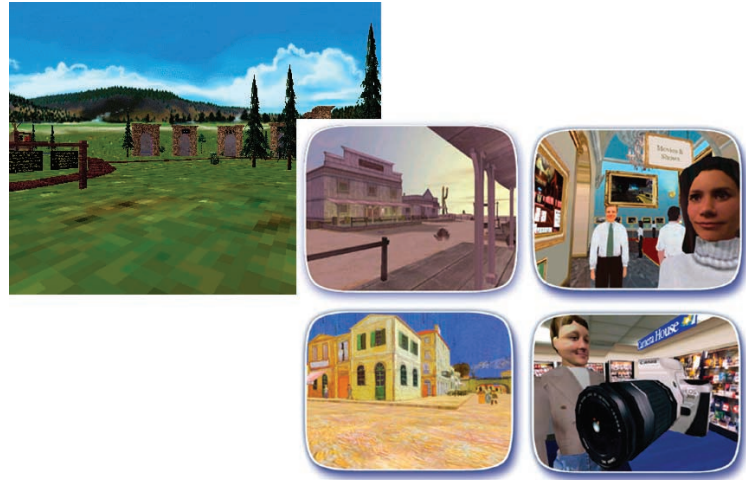
1 ActiveWorlds allows construction of 3D worlds and movement of avatars within the worlds.

Three-dimensional art and entertainment experiences, often delivered by Web applications, provide another opportunity for innovative applications. Early