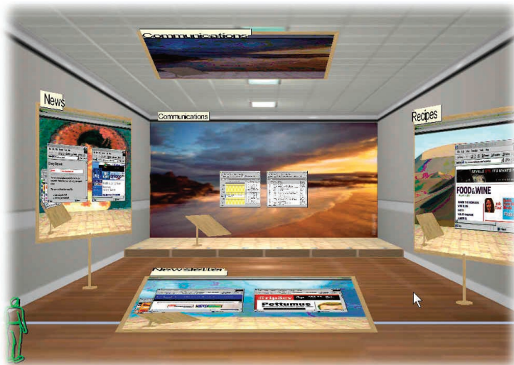
3 Task Gallery from Microsoft enables users to perform Windows operations, although it restricts movement to in/out. Applications are on the sides, floor, and ceiling.