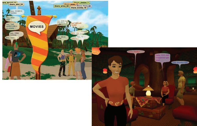
2 There.com provides avatars and text balloons to show chat discussion.

Web standards like VRML, which didn't generate huge commercial successes, have given way to richer ones such as X3D. This standard has major corporate supporters who believe it will lead to viable commercial applications.